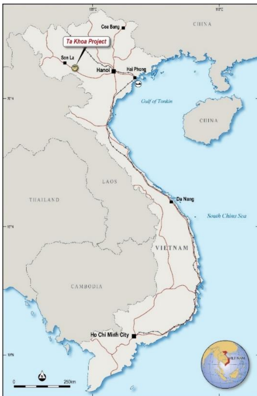
Figure 3. Ta Khoa Nickel-Cu-PGE Project Location